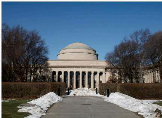
Figure 1. With Caption Below, be sure to have a good resolution image (see item D within the preparation instructions).

On pages beyond the first, start at the top of the page and continue in double-column format. The two columns on the last page should be of equal length.